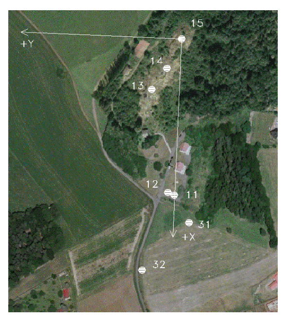
Fig. 4 Local coordinate system with recording positions of points

The survey was performed with classical geodetic methods, and for a subsequent calculation and alignment of coordinates, the local coordinate system was used, Fig. 4. According to [4], the origin of the local coordinate system is in the point 15 (y = 0 m and x = 0 m) and the positive X-axis is inserted into the point 11 (y=0 m, x=s_{11,15} ). The starting point for the trigonometric determination of heights is the point 13 (z=100 m).