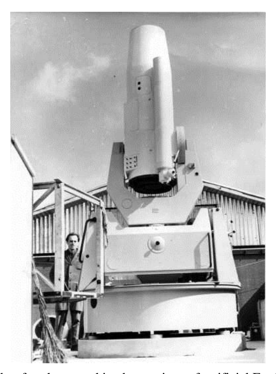
Fig. 2 The SBG chamber for photographic observations of artificial Earth satellites

The satellite observations at the Skalka station were performed mainly by means of a photogrammetric method using stationary chambers Rb-75, Fig. 1. In 1969, according to [1], the position of Šankovský Grúň in the eastern Slovakia in relation to a point on Skalka was experimentally determined, using simultaneous observations of artificial Earth satellites. In 1969, the satellite chamber SBG (producer Carl-Zeiss Jena (GDR)) was installed at the observatory. In 1970, the first Czechoslovak laser rangefinder to measure the distances to satellites was tested in this chamber, see Fig.1. The rangefinder was equipped with a pulsed laser; the optical system of the chamber was then adapted for receiving reflected signals.