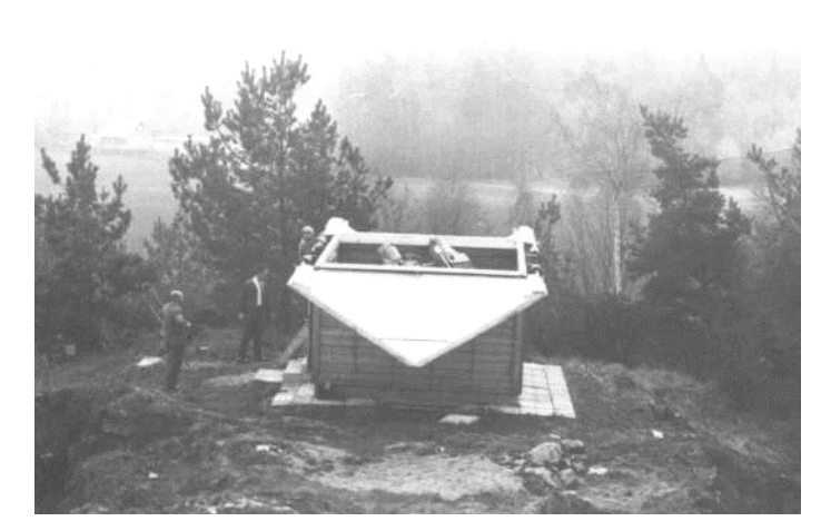
Fig. 1 Air chamber Rb-75 prepared for monitoring artificial Earth satellites

The satellite observations at the Skalka station were performed mainly by means of a photogrammetric method using stationary chambers Rb-75, Fig. 1. In 1969, according to [1], the position of Šankovský Grúň in the eastern Slovakia in relation to a point on Skalka was experimentally determined, using simultaneous observations of artificial Earth satellites. In 1969, the satellite chamber SBG (producer Carl-Zeiss Jena (GDR)) was installed at the observatory. In 1970, the first Czechoslovak laser rangefinder to measure the distances to satellites was tested in this chamber, see Fig.1. The rangefinder was equipped with a pulsed laser; the optical system of the chamber was then adapted for receiving reflected signals.